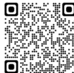
Rockliffe Manor eConsent

If you decide you do not want to vaccinate your child against flu, You Must Decline using the eConsent Form. This will automatically remove your child from the flu programme, and we will not contact you further.