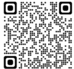
Rockliffe Manor eConsent

If you decide you do not want to vaccinate your child against flu, You Must Decline using the eConsent Form. This will automatically remove your child from the flu programme, and we will not contact you further.