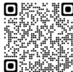
Rockliffe Manor eConsent

If you decide you do not want to vaccinate your child against flu, You Must Decline using the eConsent Form. This will automatically remove your child from the flu programme, and we will not contact you further.